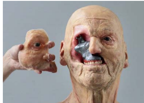
Fig. 1 Human damaged facial skull

The RP model plays the vital role in medical applications. It is used in human facial skull transparency in the medical field. Fig. 1 shows the damaged portion of the human facial skull. Fig. 2 shows the damaged portion of the facial skull has been replaced by the RP model.