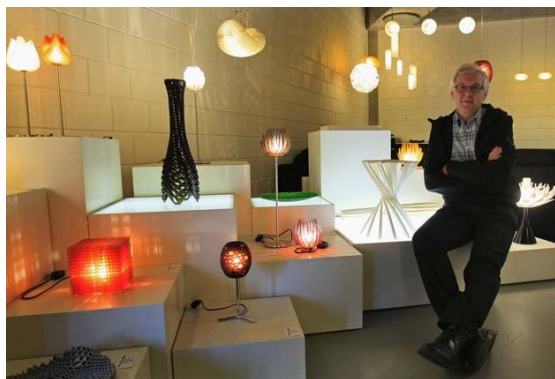
Fig. 4 RP model of an electrical appliances

The house holding electrical appliances are widely manufactured in the RP techniques. These RP techniques are very useful for manufacturing the special contours in an electrical item. Fig. 4 shows the RP models of electrical appliances.