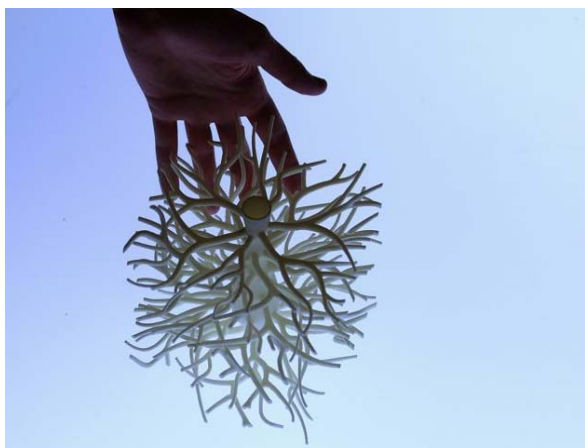
Fig. 8 (b) RP model of special objects (Tree stems)