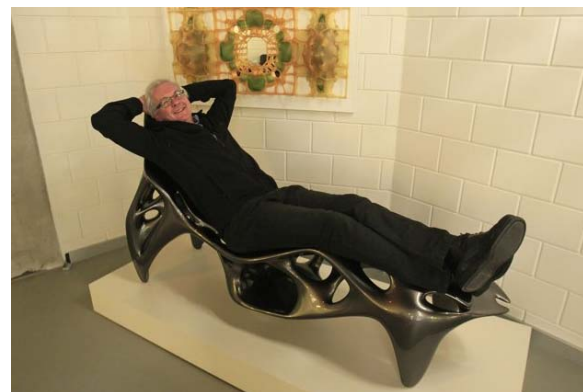
Fig. 6 RP model of furniture

The furniture is designed and manufacturing with a aid of RP techniques. This model has low weight and no temporary and permanent joints. It is made up of a single piece without any joints with different profiles. Fig. 6 shows the furniture model developed in the RP technique.