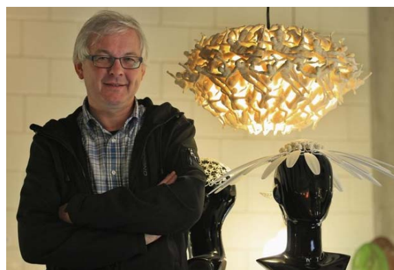
Fig. 7 RP models of an architectural interior design

An RP technique plays an important role in architectural interior design like stature, wall mountings and toys. The RP model of interior decoration has good surface finishing and aesthetics compared with convention models. Fig. 7 shows RP models of an architectural interior design.