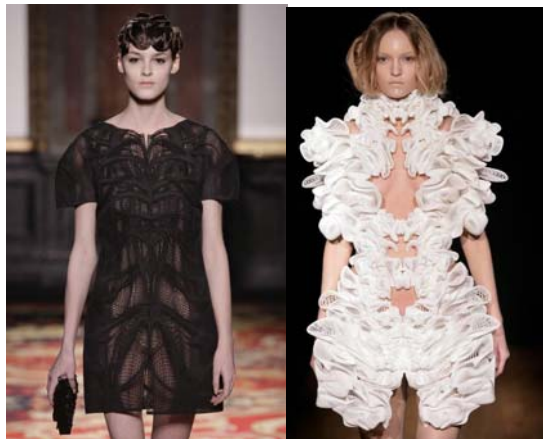
Fig. 3 RP model of dresses with special contours