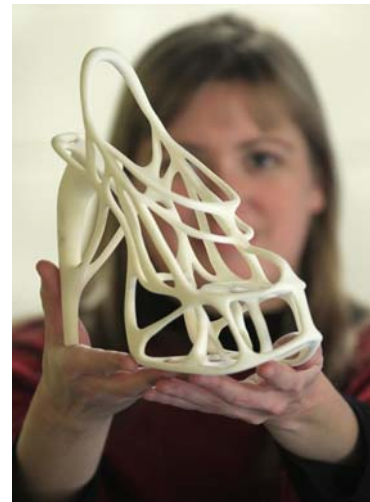
Fig. 5 RP model of foot-ware