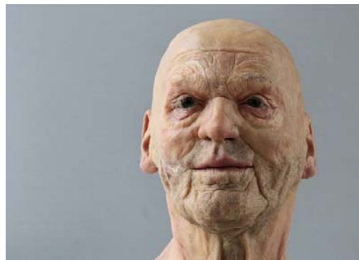
Fig. 2 Damaged facial skull replaced by RP model